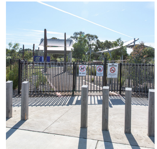
Car park entry