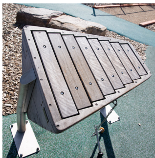
8-key accessible marimba

A set of three stainless steel drums standing 450mm high produce a ringing gong or cymbal like sound. Instrument can be played with hands, fingers or sticks. Visit YouTube to see gong drums in use.