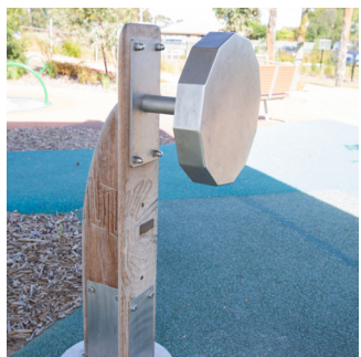
Musical rain wheel

Standing 1m high and accessible for wheelchairs, this iron bark and stainless-steel rain wheel produces rain like or shaker sounds. Sounds are activated by turning or spinning the wheel either way. Visit YouTube to hear a rain wheel.