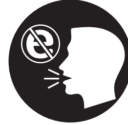
I don't speak English