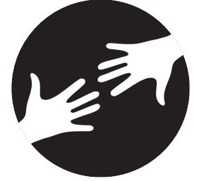
I need help