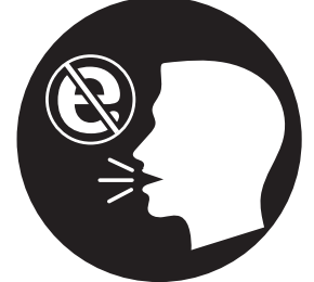
I don't speak English