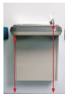
knee clearance operating height