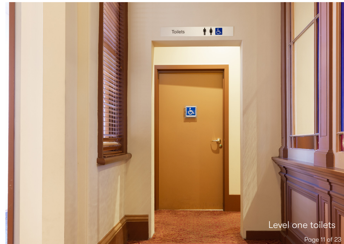
Level one toilets