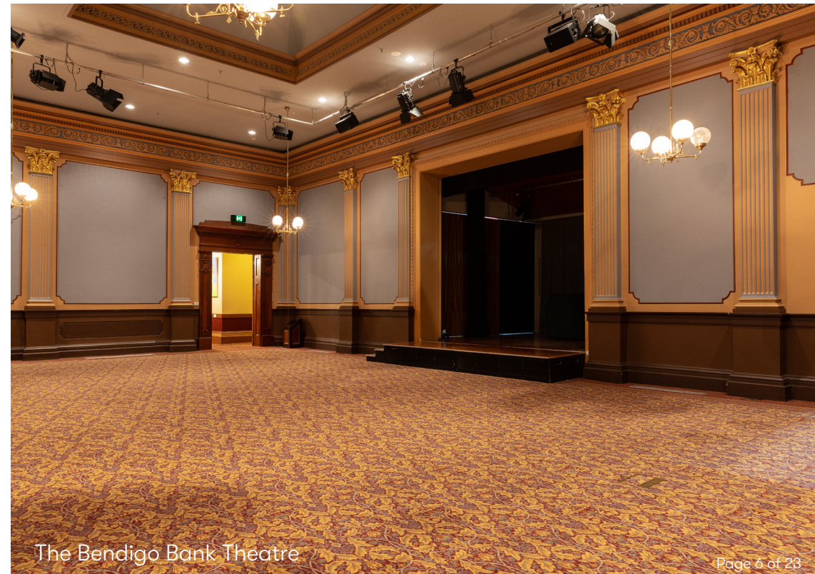
The Bendigo Bank Theatre