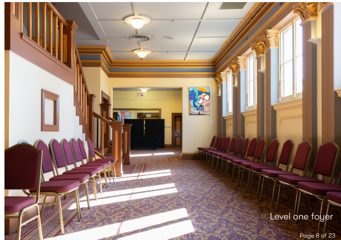
Level one foyer