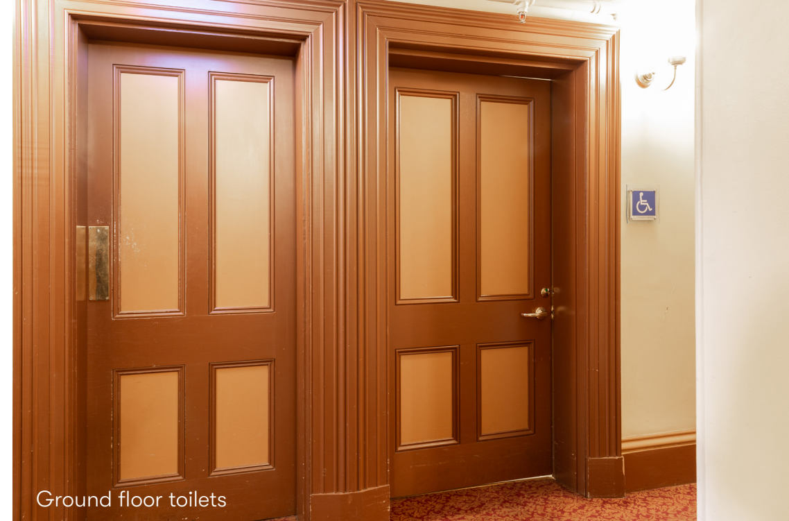
Ground floor toilets

My support person will be able to show me where they are.