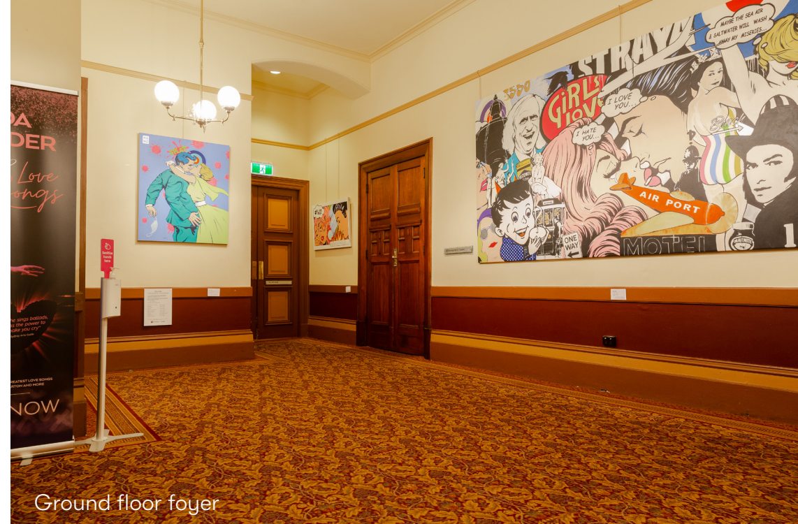
Ground floor foyer

I might go to a foyer to wait for the performance to begin.