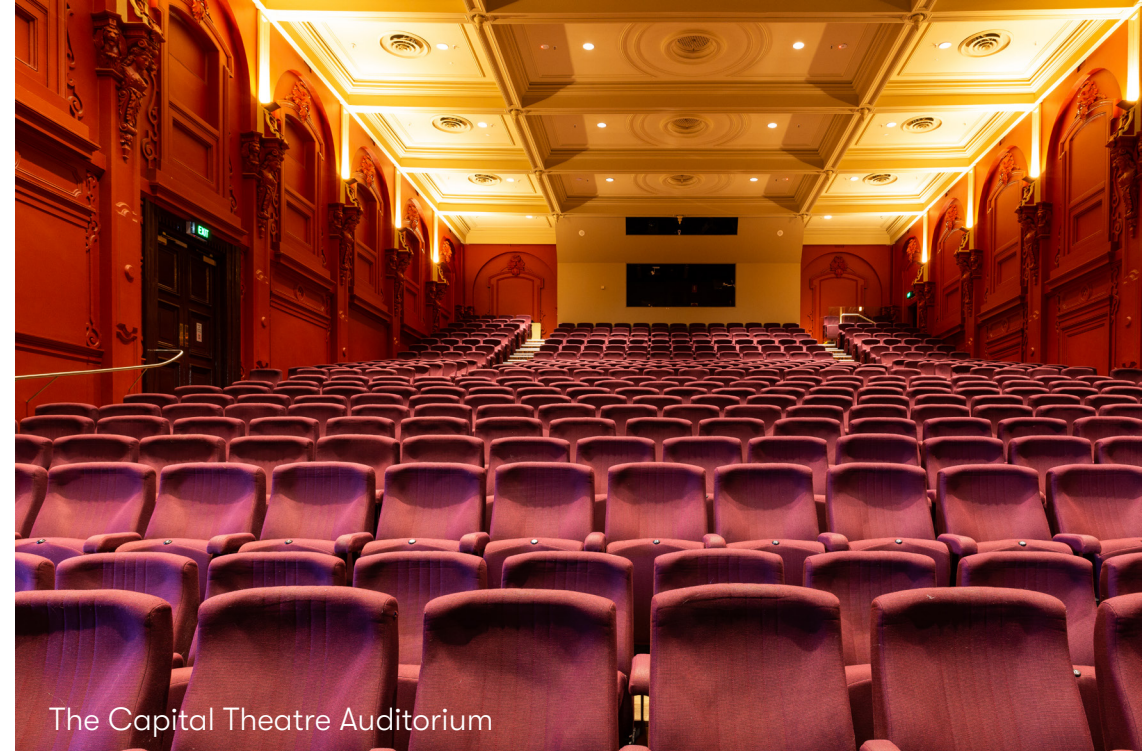
The Capital Theatre Auditorium