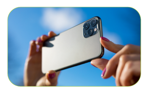
Landscape Images Place your phone on its side to advantage of the wider-angle photo.

Some mobile phone cameras have a single lens and flash, some camera phones have multiple lens.