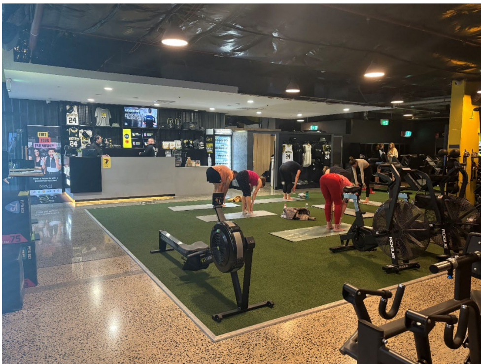
Functional training zone